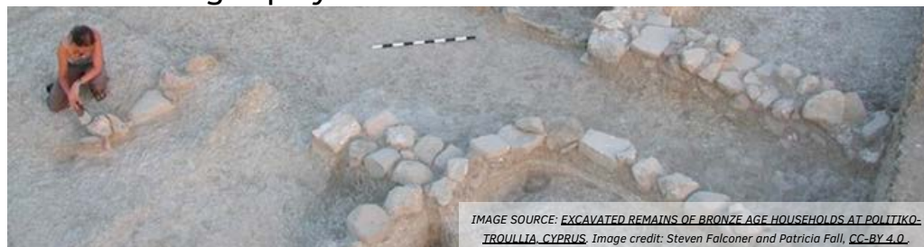
IMAGE SOURCE: EXCAVATED REMAINS OF BRONZE AGE HOUSEHOLDS AT POLITIKO-TROULLIA, CYPRUS.